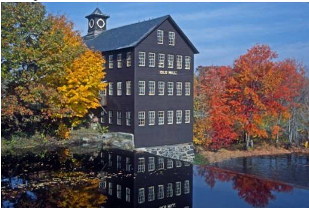
Figure : Old Mill in Hatfield

Fred Contrada from the Republican newspaper wrote in November about plans to create a rail trail from Damon Road up into Hatfield.